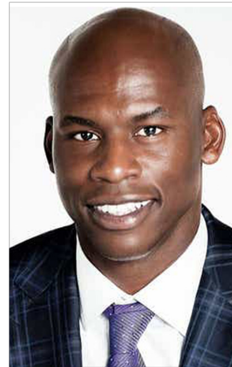
SPECIAL GUEST AL HARRINGTON