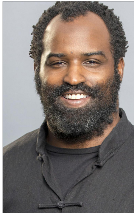
SPECIAL GUEST RICKY WILLIAMS